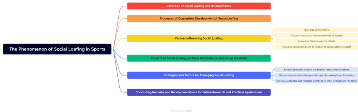
Figure 1. Conceptual Map of the Content Structure of Psychological Characteristics of the Phenomenon of Social Loafing in Sports

A collection of articles by Singh et al. explains the understanding of group behavior in volleyball from the perspective of social loafing. Garcia-Gonzalez et al. provide valuable insights into how team cohesion impacts social loafing in volleyball (Singh et al., 2018).